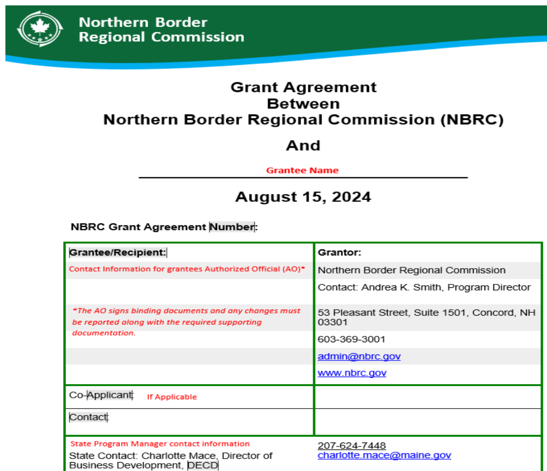
Figure 3: Annotated Grant Agreement

The grant agreement will contain basic project information as outlined in Figure 3. below and all applicable grant provisions.