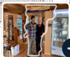
Business & Workforce Development