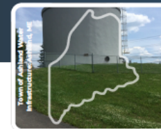
Basic Public Infrastructure

NBRC flagship grant program designed to support a broad range of economic development initiatives that will modernize and expand the region's basic infrastructure and revitalize communities to support and attract the region's workforce.